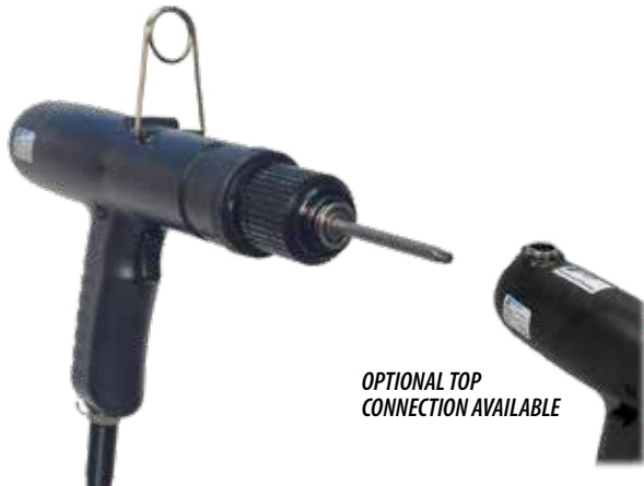
OPTIONAL TOP CONNECTION AVAILABLE

*Standard model has cable connection in bottom of handle — for top connection, add suffix 'U'. For ESD-safe housing, add suffix '-ESD'.